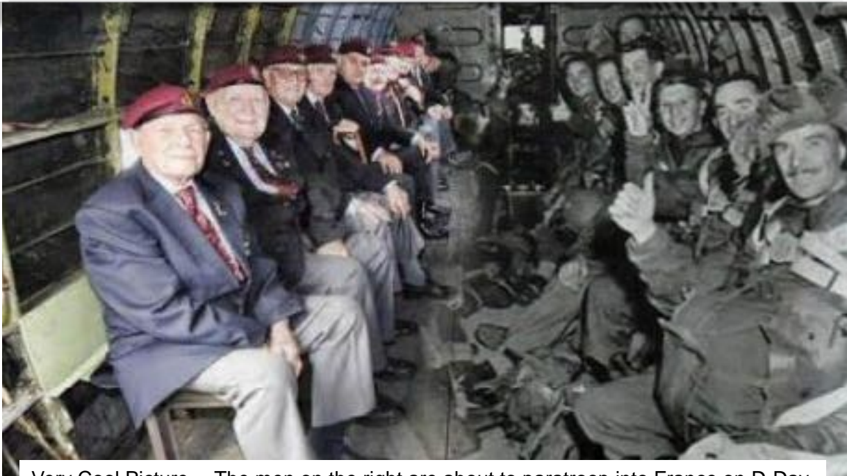
Very Cool Picture... The men on the right are about to paratroop into France on D-Day. The men on the left are the same men today. More remarkable? It's the same plane.