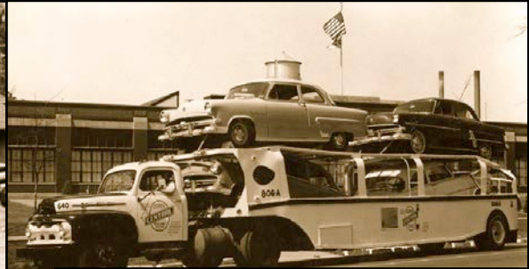
Above...Other haulers of the era with tons of brand new Ford models on their way to dealerships and eventually to our garages.