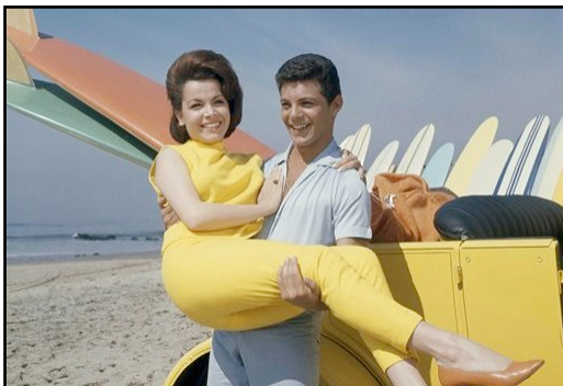
"Mouseketeer" Annette Funicello, also known for her beach movies with Frankie Avalon, has died at age 70. In this 1963 file photo, singer Frankie Avalon and actress Annette Funicello on Malibu Beach during filming of "Beach Party".