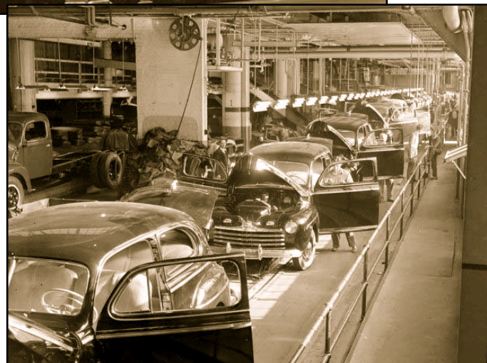
Right... First Fords after WWII. 1946 Ford cars and trucks roll off the assembly line.